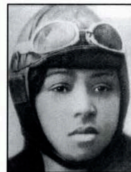
Bessie Coleman (Pilot)